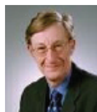
Prof Sir Michael Rawlins