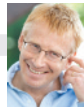
Dr Phil Hammond