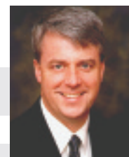
Rt Hon Andrew Lansley